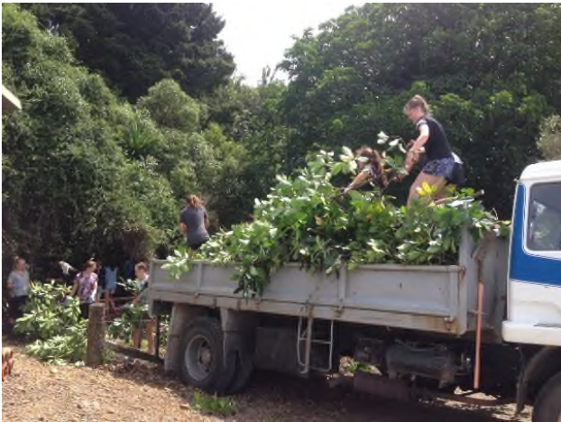
Bush restoration project

Two working bees were held to restore the bush remnant on the Nga Tawa grounds. A group of willing parents and volunteers set about chain sawing, lopping and weed-eating through way through the invasive or over dominant species.