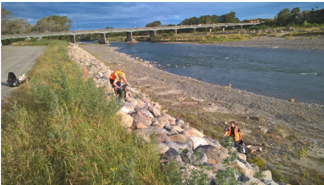
Rubbish collection at the Bulls bridge area

On the first collection we removed a truckload of rubbish ranging from car tyre's to decomposing animal carcasses. In my view, the worst offence was seeing a large ute load of items thrown onto the riprap embankment of the river near the raised picnic area. In the next flood this toxic rubbish would have ended up in the Rangitikei River. This River is so important to our region we need to take better care of it.