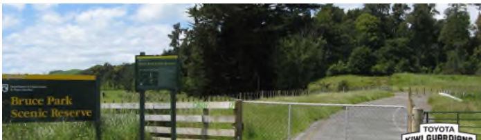
Bruce Park, Hunterville

This is an addition to the two current sites located at Bruce Park, Hunterville and the Manawatu Gorge.