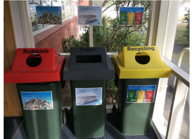
New recycling scheme

Envirogroup conducting a waste audit and finding that 50% of the waste produced around school could be recycled. Currently these new bins are in the classroom blocks but we hope to extend the scheme in 2017.