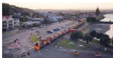
First logging train arriving in Napier from Karioi - Napier Port.