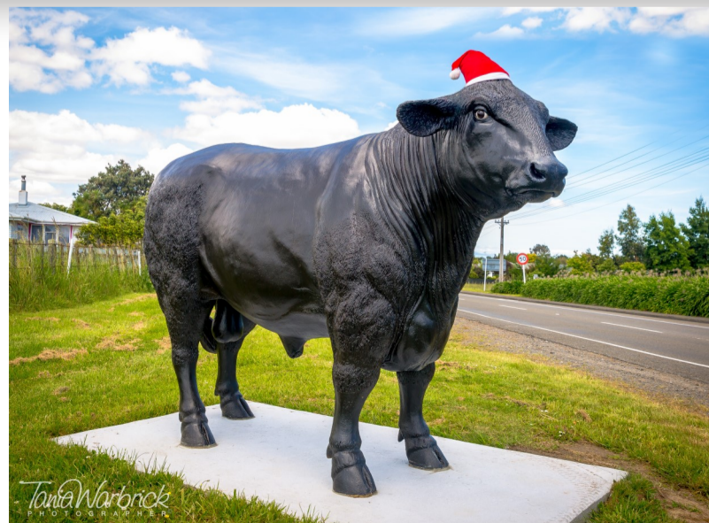
Even our new Bulls in Bulls got into the spirit of Christmas!!